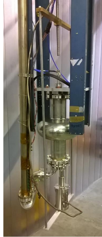
Figure 3: Picture of the variable coupler attached to a 1.3 GHz single-cell cavity mounted onto a vertical test stand.

The total cost for the hardware and materials, including linear feedthrough and stepper motor was about $3,000.